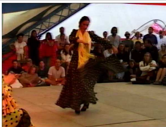
Dawson City Music Festival, July 1997