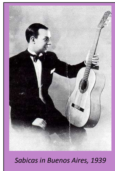
Sabicas in Buenos Aires, 1939

Sabicas returned to Spain from his voluntary exile in 1967 when he attended a tribute held for him in Málaga. In 1982, his home city of Pamplona dedicated its San Fermín fiesta to him. He returned to play in Spain many times in his later years.