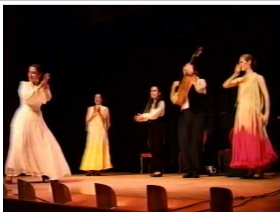
Dawson City Music Festival, July 1997